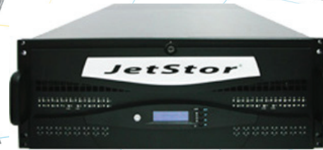
JETSTOR SAS 660iSD

The JetStor SAS 660iS Series of RAID systems deliver 1,600 MB/second through 1Gb/sec Ethernet host connections to enable the most demanding applications. Outstanding throughput coupled with fast random access eliminates bottlenecks in your most demanding applications, diminishing response times and increasing productivity. The JetStor SAS 660iS RAID systems accelerate databases, file servers, production applications, imaging, and any application demanding the instantaneous delivery of records, small and large files.