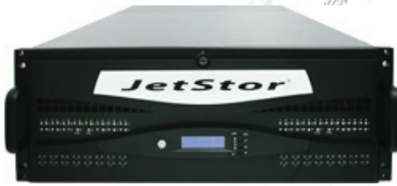
JETSTOR SAS 660IS 10G