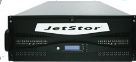
JETSTOR SAS 660ISD 10G

The JetStor SAS 660iS 10G Series of RAID systems deliver 1,600 MB/second through 10Gb/sec Ethernet using iSCSI protocol, SFP+ host connections to enable the most demanding applications. Outstanding throughput coupled with fast random access eliminates bottlenecks in your most demanding applications, diminishing response times and increasing productivity. The JetStor SAS 660iS 10G RAID systems accelerate databases, file servers, production applications, imaging, and any application demanding the instantaneous delivery of records, small and large files.