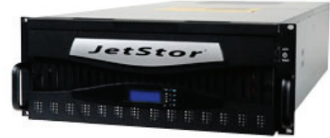
JETSTOR SAS 742FD