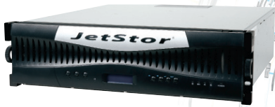
JETSTOR SAS 716FD